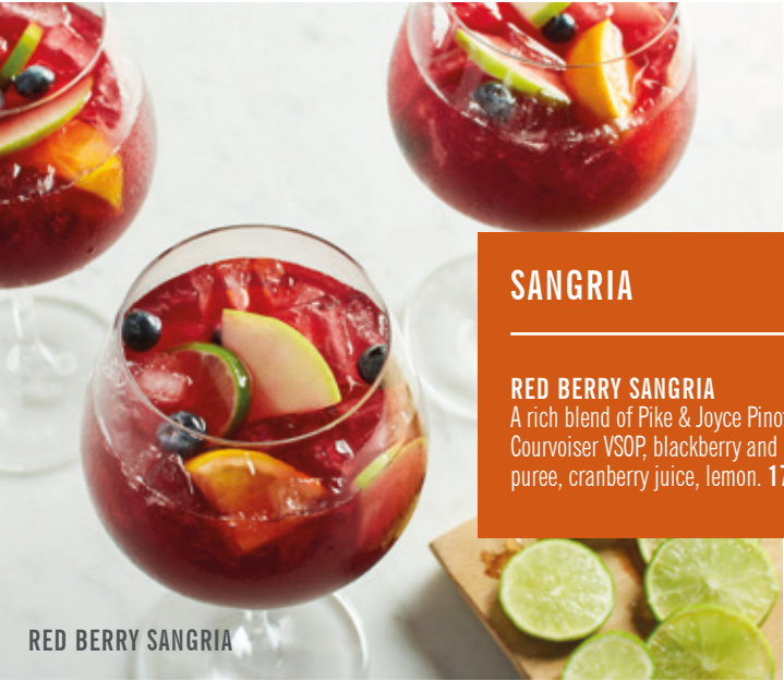
RED BERRY SANGRIA

RED BERRY SANGRIA A rich blend of Pike & Joyce Pinot Noir, Courvoiser VSOP, blackberry and raspberry puree, cranberry juice, lemon. 17.5